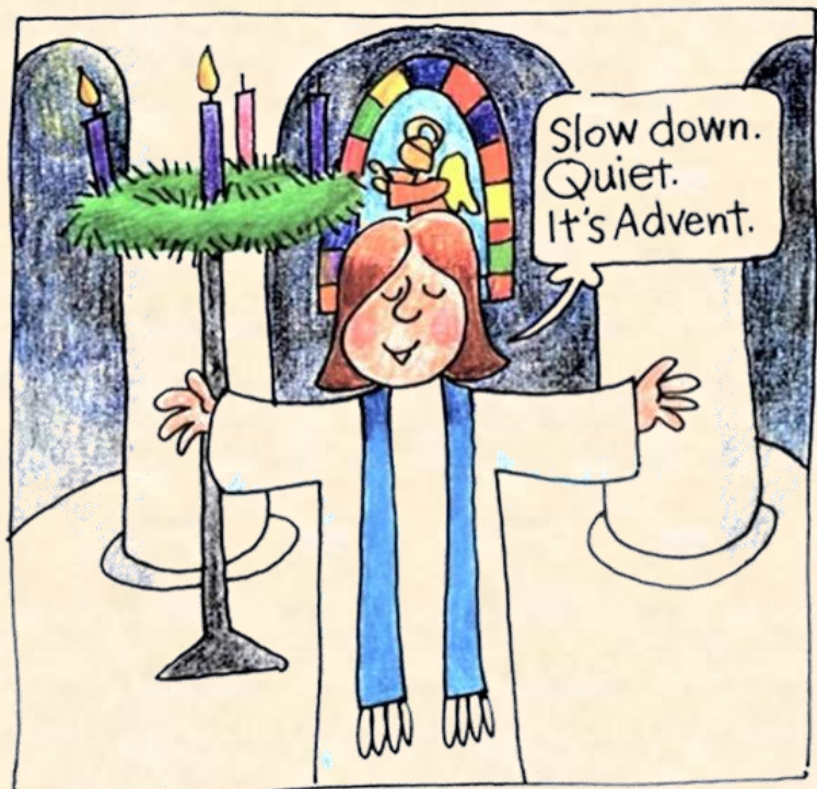
ONE SUNDAY IN ADVENT