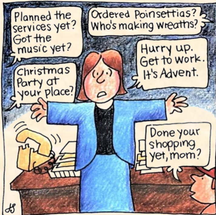
ONE MONDAY IN ADVENT

Parish Office 40 Main Street P.O. Box 887, WHB, NY 11978 Office Phone: 631.288.2111